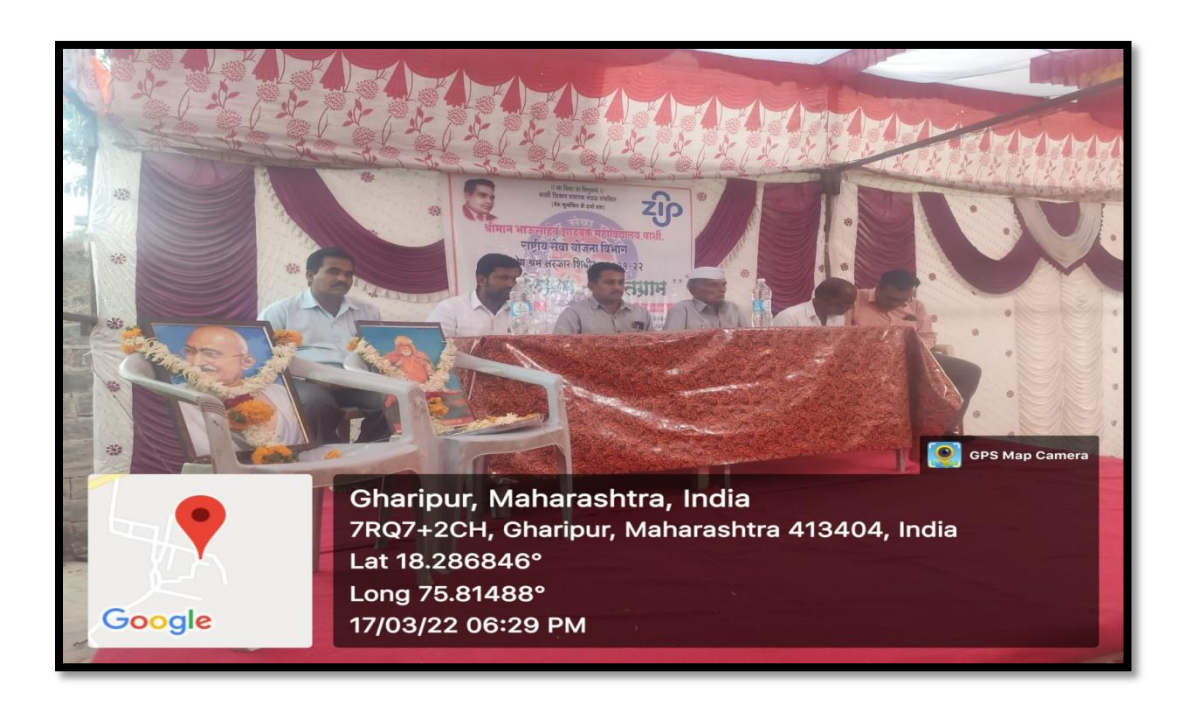
Inauguration function of NSS Camp