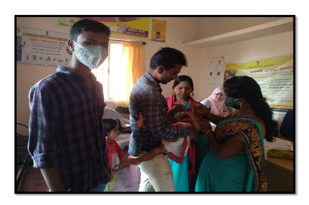
Pulse Polio Program