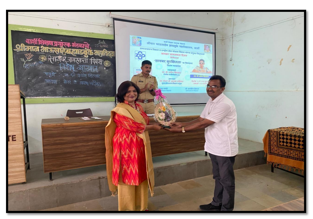
Cyber Awareness Program