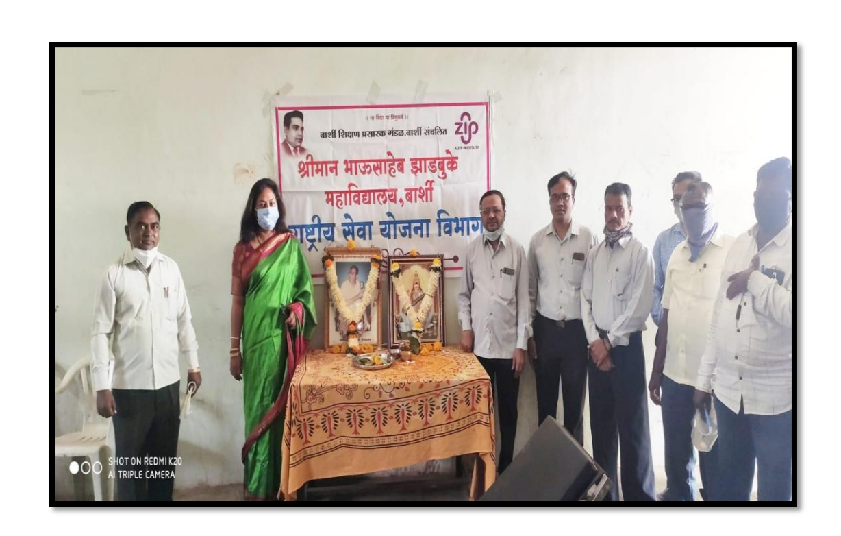
Blood Donation Program