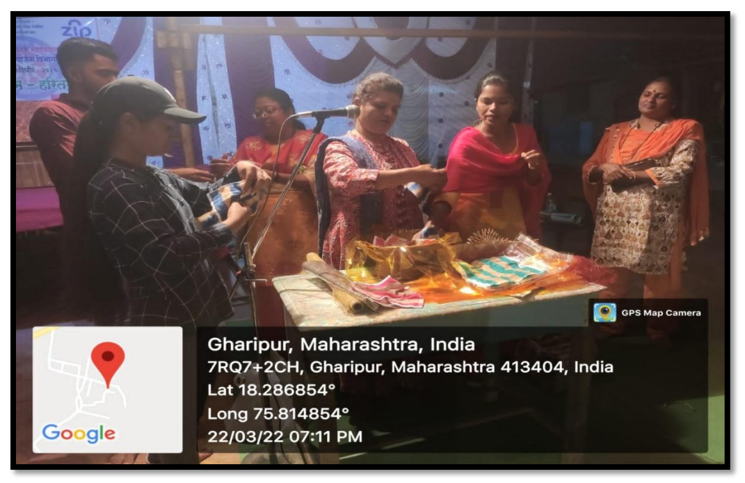
Guidance to Volunteers about making Organic Soap